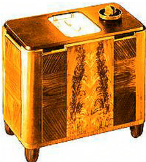
Philco Model 16CPX-TU "Century Of Progress"