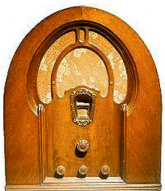
Philco Model 14B