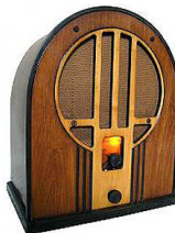
Philco Model 84B