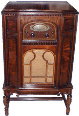
Atwater Kent Model 469 Lowboy