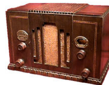
Atwater Kent Precision Radio Model 825