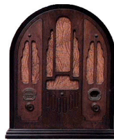
Atwater Kent Precision Radio Model 944