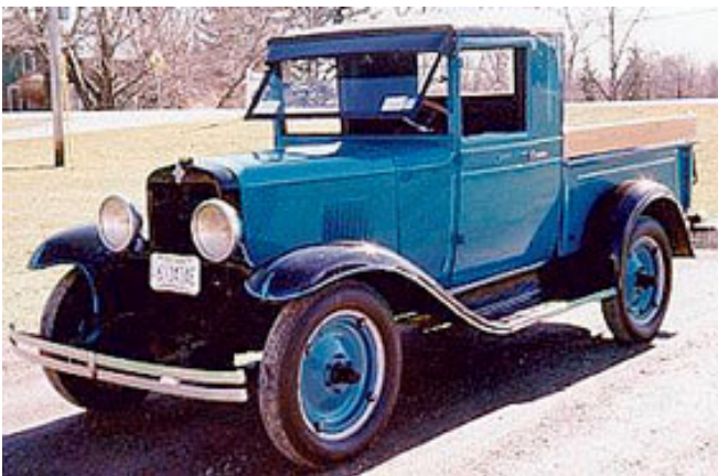
Chevrolet International "Light Delivery"