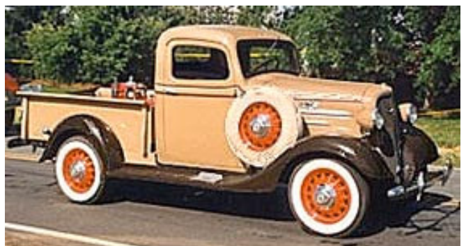
Chevrolet Series FB Master Commercial