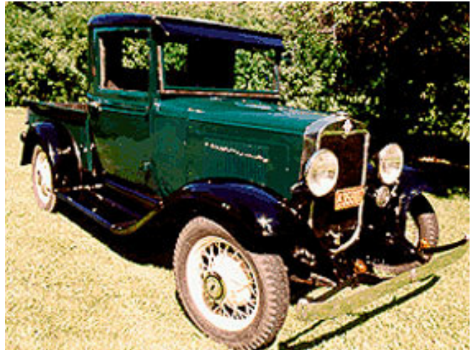
Chevrolet Confederate "Light Delivery"