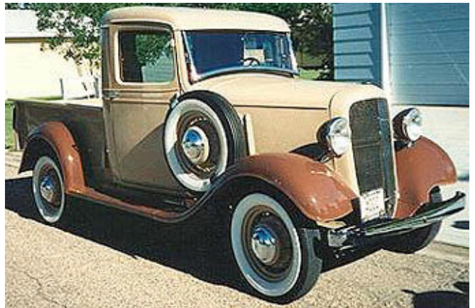
Chevrolet Series DB Master Commercial