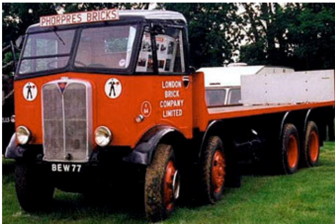
AEC Mk II Mammoth Major 8