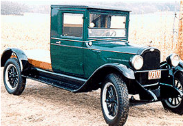
Chevrolet Model 490 "Light Delivery"

Note: Renamed "Superior" in 1922-1927, and "Capitol" in 1927-1928.